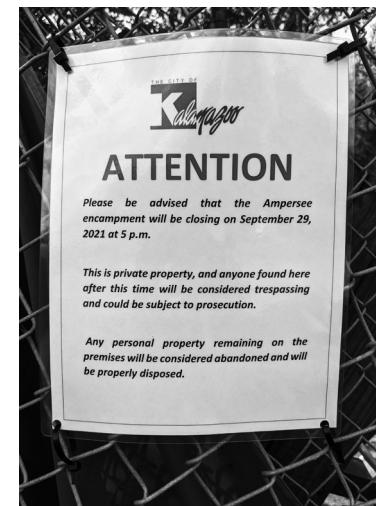
Trespassing notice posted on Sep 15th for the 29th

In the two weeks following the eviction notice, camp residents were asked what their plan was for the 29th. Some people planned to move to Stadium camp on the west side of town; however, an eviction notice for the PlazaCorp-owned (a billion dollar multinational corporation) land had been posted for October 1st. Most had no idea where to go or how to move their belongings, and didn't want to leave because they had made Hotop their home. Many campsites were more than just a tent on the ground, they were creatively make-shift structures with windows and doors, with furniture and carpets, areas people kept tidy and felt proud of. Above all, the city had forced them to move to this field, and now they were being told to not just leave, but to leave to nowhere as it became policy for cops to collapse any tent set up