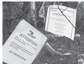
Flyer for Oct 4th and No Trespassing Signs

Jim - Circling back on this, we definitely need KDPS to be on top of directed patrols near the encampment site and be aware of where people may go next. I suggest we follow our informal protocol of zero tolerance in parks, near well fields, former encampment sites that have been closed; and taking action when asked by private property owners to enforce No Trespassing. Beyond that, we need to monitor sites and intervene when we see more than 3 - 4 tents together. We need to "thread the needle" of staying on top of this without chasing people without housing all over town.