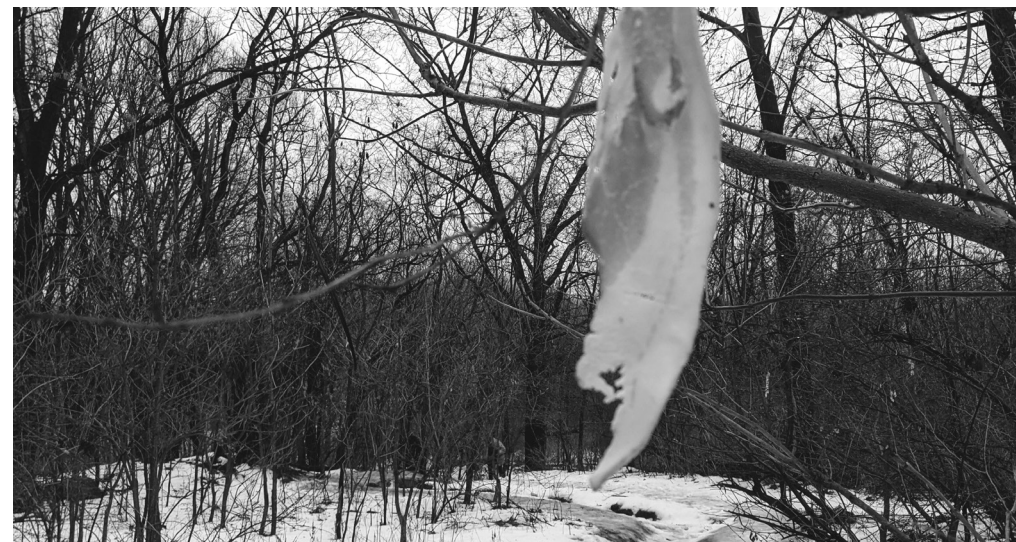
Bacon hanging at a camp anticipating police