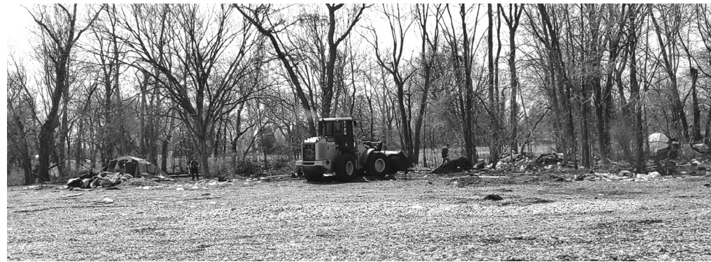
Bulldozer and crews destroying what was left of Mills Camp