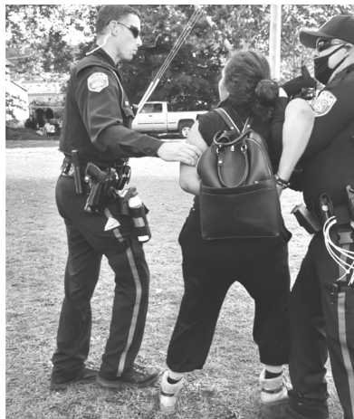
Police arresting protestors on Oct. 8th (all)