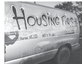
Someone's van with HOUSING FIRST painted on it