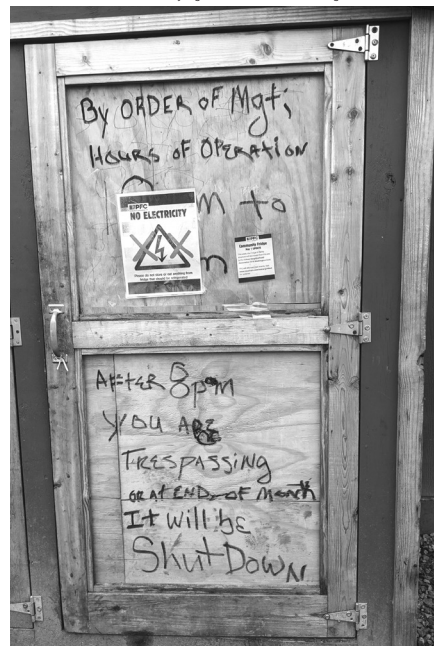
Door of the community fridge as it is announced it's being moved

The rumor is the city is looking for a new plot of land for an encampment. If that is indeed their plan, it seems as though the many sweeps, and all of the tragedies that accompany them, could have easily been avoided.