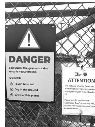
Signs posted warning of the contaminated soil and flooding

Warning signs began being posted at Hotop, indicating the presence of toxic materials in the soil. The Hotop camp was situated on a super contaminated piece of land owed by the city and under control of the Brownfield Redevelopment Authority. The Brownfield Redevelopment Authority is a city entity which secures plots of land polluted with heavy metals and toxic waste, then sells them at a cheap price (usually to white business owners) for development purposes. Let us not bypass this information without acknowledging the impact it has on gentrification, individuals living in historically redlined districts, and environmental racism. The fact is the residents of Hotop were told to go there by the police, some even getting rides to camp in squad cars, all while