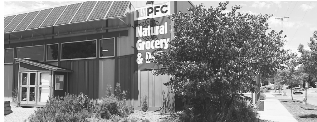
Community Fridge Pantry at the People's Food Co-op

At least 4 individuals died during the winter months following the Hotop eviction.