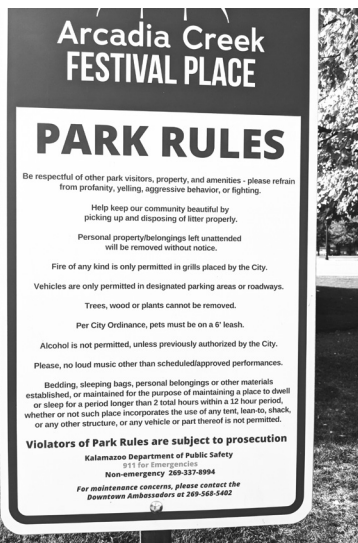
Rules posted in Arcadia Creek Festival Place