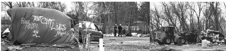
"Please Help! Tent City Lives Matter" painted on a tarp at Mills St. camp