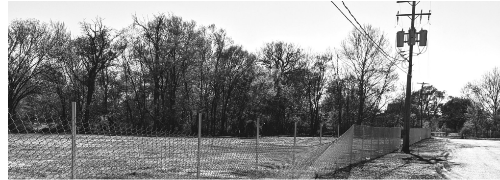
Fenced-off lot where the Mills St. camp was

Arcadia Creek Park is located across the street from KGM and shares a parking lot with recently-renovated luxury loft apartments. For years, many folks would utilize the park while the shelter closed during the day, others would sleep there as well. During winter 2022, the police amped up their presence at the park, sweeping it daily. New