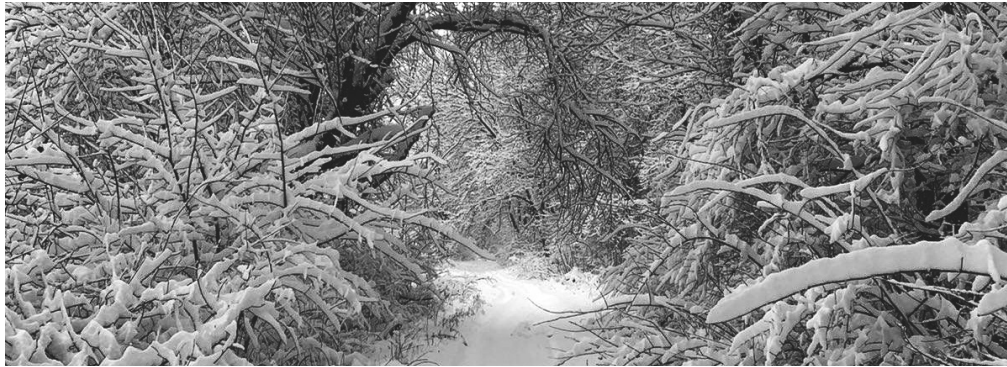
Trailhead for camp