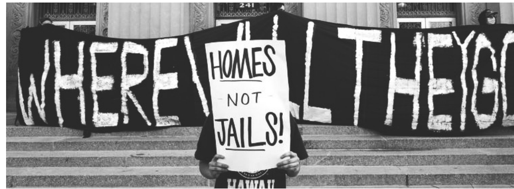
Protest in front of City Hall Sep. 15th