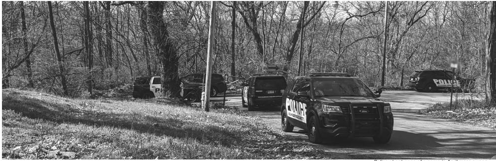
Police at entrance of a camp in April mass sweep