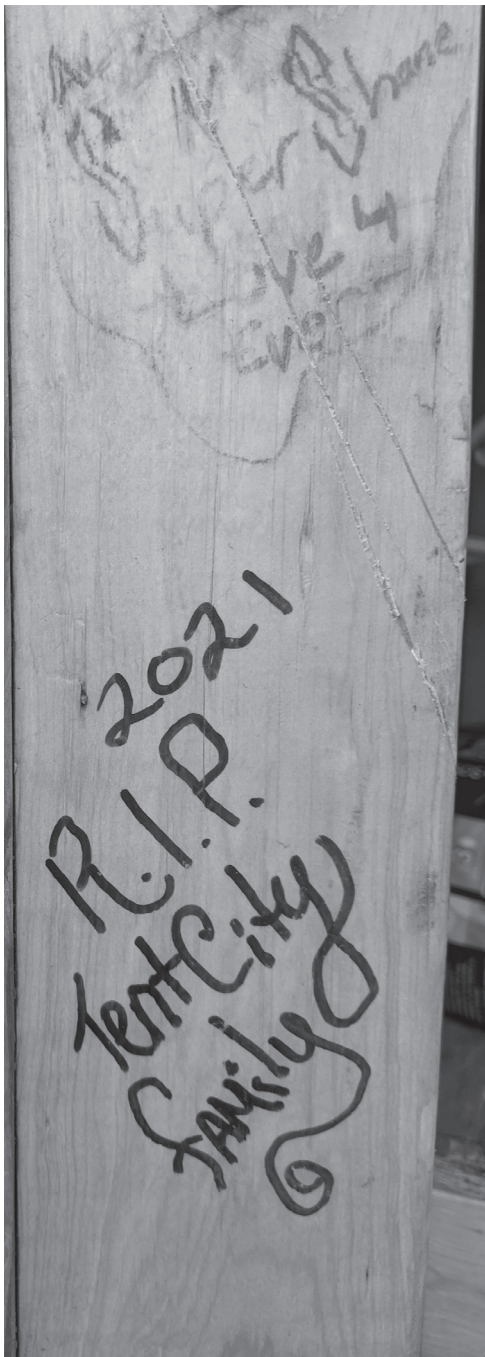
2021 "RIP Tent City family" written on the Community Fridge Pantry